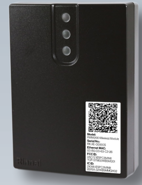
RMW200 Wireless Module